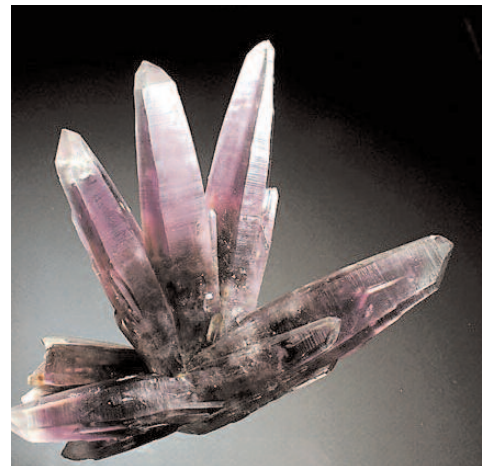
Aquamarine from Pakistan