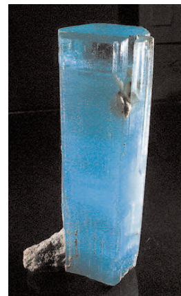
Amethyst from Guerrero, Mexico